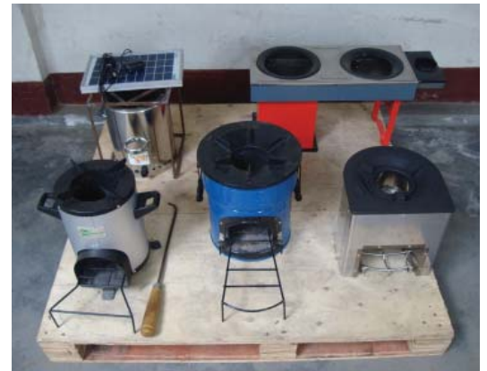
The improved cookstoves used in the Phase One trial, clockwise from top left: Eco-Chula, Prakti, Envirofit, EcoZoom, and Greenway.

ICS fuel efficiency was measured using a three-day kitchen performance test (KPT), widely acknowledged as the best currently available method for accurately estimating daily household fuel consumption. The KPT was carried out using a cross-sectional study design in 116 study households and 24 control households. Two approaches were used to measure the