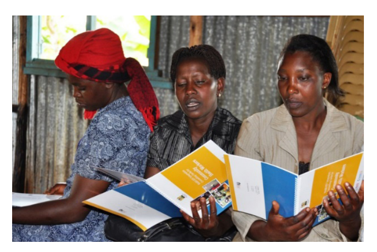
Community health workers read job aids.

At the onset of its interventions, the WASHplus program in Kenya identified a big gap in appropriate information resources on WASH practices addressing the needs of people living with HIV.