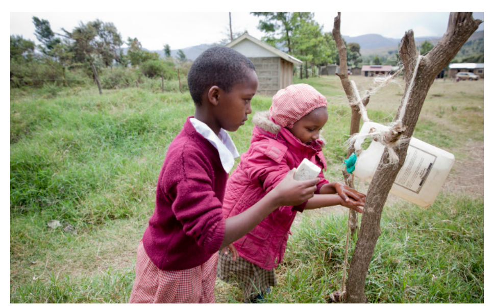
Primary School children in Maa Mahiu. Such good hygiene practices should begin in pre-school.

In Kenya, over 5.8 million Kenyans still defecate in the open [JMP 2013]. This increases the risk of diarrhea, which is among the top five killer diseases in the country. To address the problem, Kenya has adopted the community led total