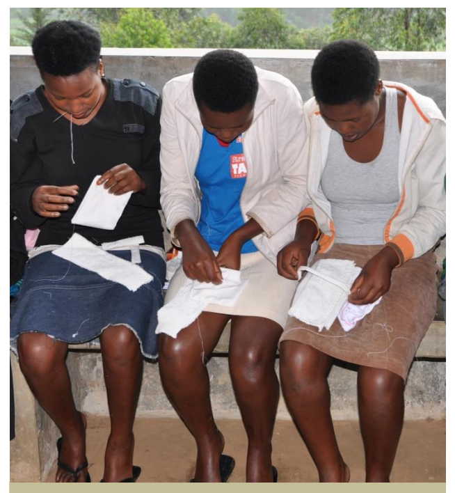
Girls take menstrual hygiene management into their own hands as they make reusable menstrual pads, one of the many small doable actions WASHplus helped to promote.

As a strategy for sustainability and scale, WASHplus bolstered district government and USAID implementing partner services and programs, rather than implementing its own activities. WASHplus collaborated with implementing partners such as Uganda Community Connector, Food and Nutrition Technical Assistance (FANTA) III, Strengthening Decentralization for Sustainability (SDS), STAR-SW, SPRING, and Reproductive Health Uganda.