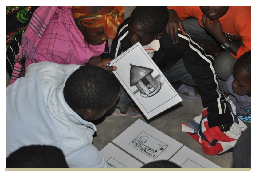
Negotiation cards were pretested in the districts and translated into two local languages and will guide interactions between health workers/volunteers and households/patients.

Two capacity building guides, one for Integrating WASH into Nutrition and the second for Integrating WASH and HIV have also been updated based on the WASHplus experience in training and building district capacity. These guides are also available through the districts, USAID implementing partners, and on