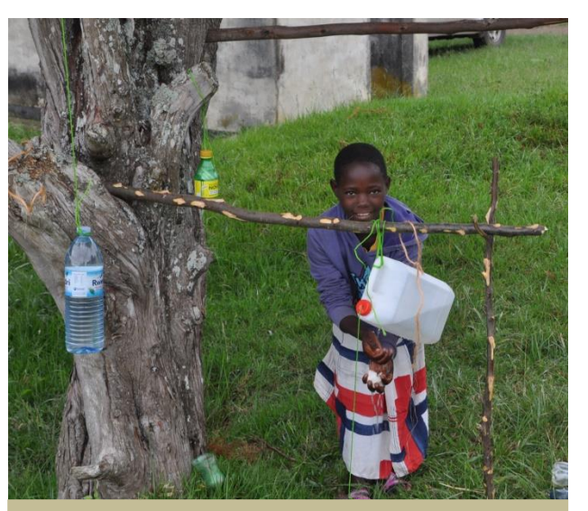
Building a tippy tap is one small doable action WASHplus helped promote to improve hand washing hygiene at homes and schools.

Below is a pictorial representation excerpted from a more comprehensive job aid developed for Ugandan VHTs of small doable actions related to safe water handling. The first illustration depicts the unacceptable current practice of leaving