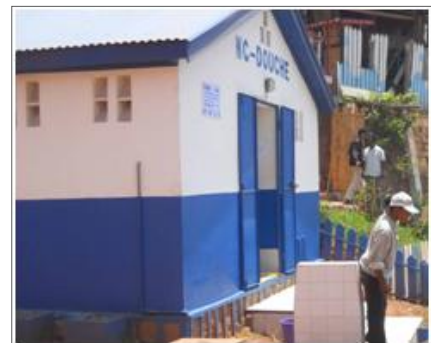
WASHplus has been exploring the viability of public-private management of sanitation blocks in Madagascar.

As Year Two came to a close, Madagascar was winding down several activities that had occupied much of its time this year—support to Water and Sanitation for the Urban Poor (WSUP) sanitation activities, coordination and rehabilitation of sanitation blocks, and a field review of USAID-funded WASH. Though it took a while to finalize the WSUP agreement, once in place, WASHplus supported the construction of water kiosks, promotion of the production and sale of SanPlats, and implementation of the WASH-Everywhere strategy, in collaboration with partners such as CARE and WaterAid. The activities took place in two peri-urban communes in the Analamanga region of Antananarivo, Bemasoandro and Andranonahotra. WSUP was charged with ensuring the best use and sustainability of existing structures, rehabilitating or building additional services such as water kiosks or collection points, and increasing hygiene and sanitation activities aimed at households. To support these efforts WASHplus undertook technical studies, requested cost estimates, established building plans, built local partner’s capacity, controlled and approved water kiosk work plans, and prepared tender agreements. WASHplus was also involved in the rehabilitation of two sanitation blocks.