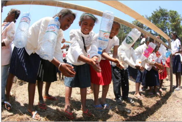
Celebrating Global Handwashing Day in Madagascar.

Other activities this year included presenting and participating in Emory's "Getting WASH in Schools Right" conference and obtaining project contributions from UNICEF and Colgate-Palmolive. WASHplus also represented PPPHW at a World Water Day program sponsored by the Washington, DC WASH coalition, giving a presentation at the Hand Washing 101 session and participating in a panel discussion on public-private partnerships along with representatives from CARE and the Global Water Alliance. PPPHW launched a redesigned website