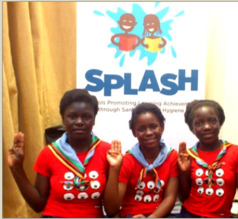
Zambian Girl Guides presented a poem on their right to quality education and school WASH facilities at the Eastern Province Indaba.