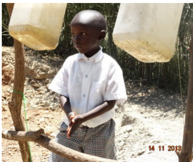
A child washes hands at one of the early childhood development centres in Maai Mahiu.