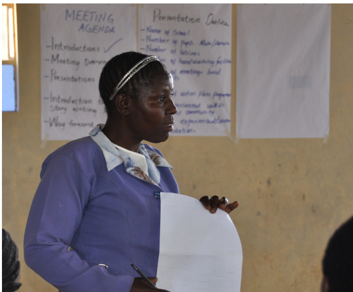
A teacher makes a presentation during a progress review meeting in Naivasha.

Schools often provide models for desired behaviors that we hope children will bring back home. Maai Mahu division of Nakuru County, USAID's WASHplus Program is working with early childhood development centres to teach children about good sanitation and hygiene.