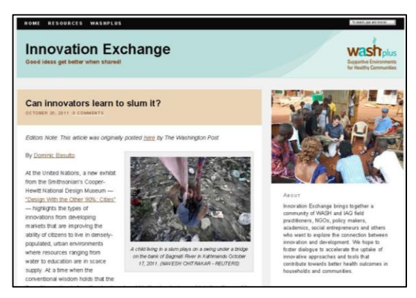
A page from WASHplus's Innovation blog, which serves as an information exchange platform and a community forum for healthy household and community innovations.

WASHplus is taking a challenge-driven approach to innovation. Central to this approach is a preliminary list of innovation challenges that will guide and focus WASHplus and introduce external stakeholders to the project's innovation agenda. This list of innovation challenges was refined over the course of Year One through interactions with a select group of external stakeholders and vetted with the WASHplus AOTR. An inventory of partner innovation activities was also initiated to better understand potential partnerships.