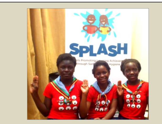
Zambian Girl Guides presented a poem on their right to quality education and school WASH facilities at the Eastern Province Indaba.